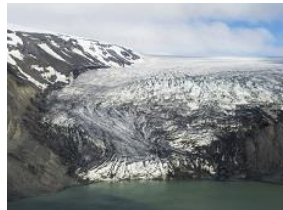
Call for mountain climate change experts