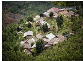
UN report on sustainable mountain development