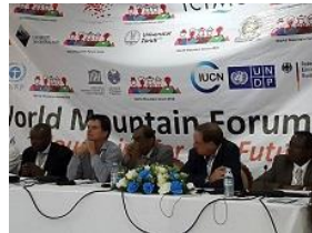
Outcomes of the 2016 World Mountain Forum